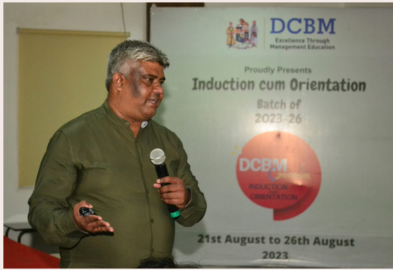
Induction Week Day 5 was marked with an insightful session conducted by Miles Education , shedding light on the spectrum of global certifications available to our students.