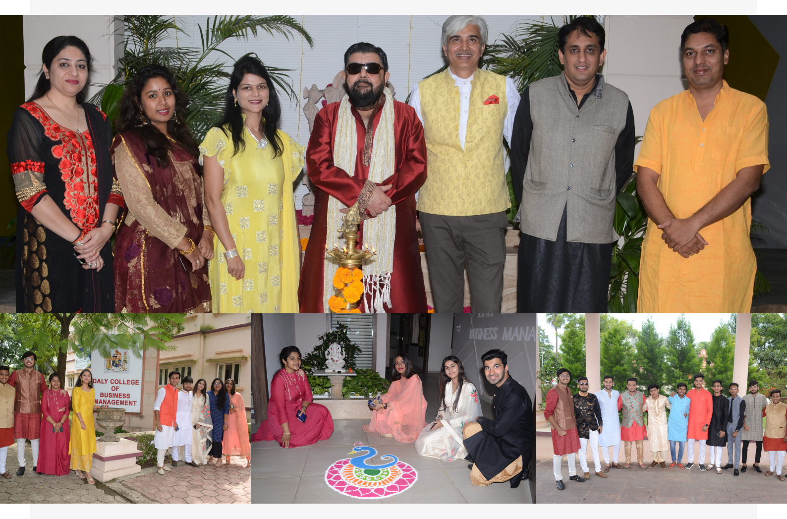
Diwali Celebrations!! Festivity, Fun, Frolic, Diya painting, Colourful rangolis, Traditional fervour!!!!